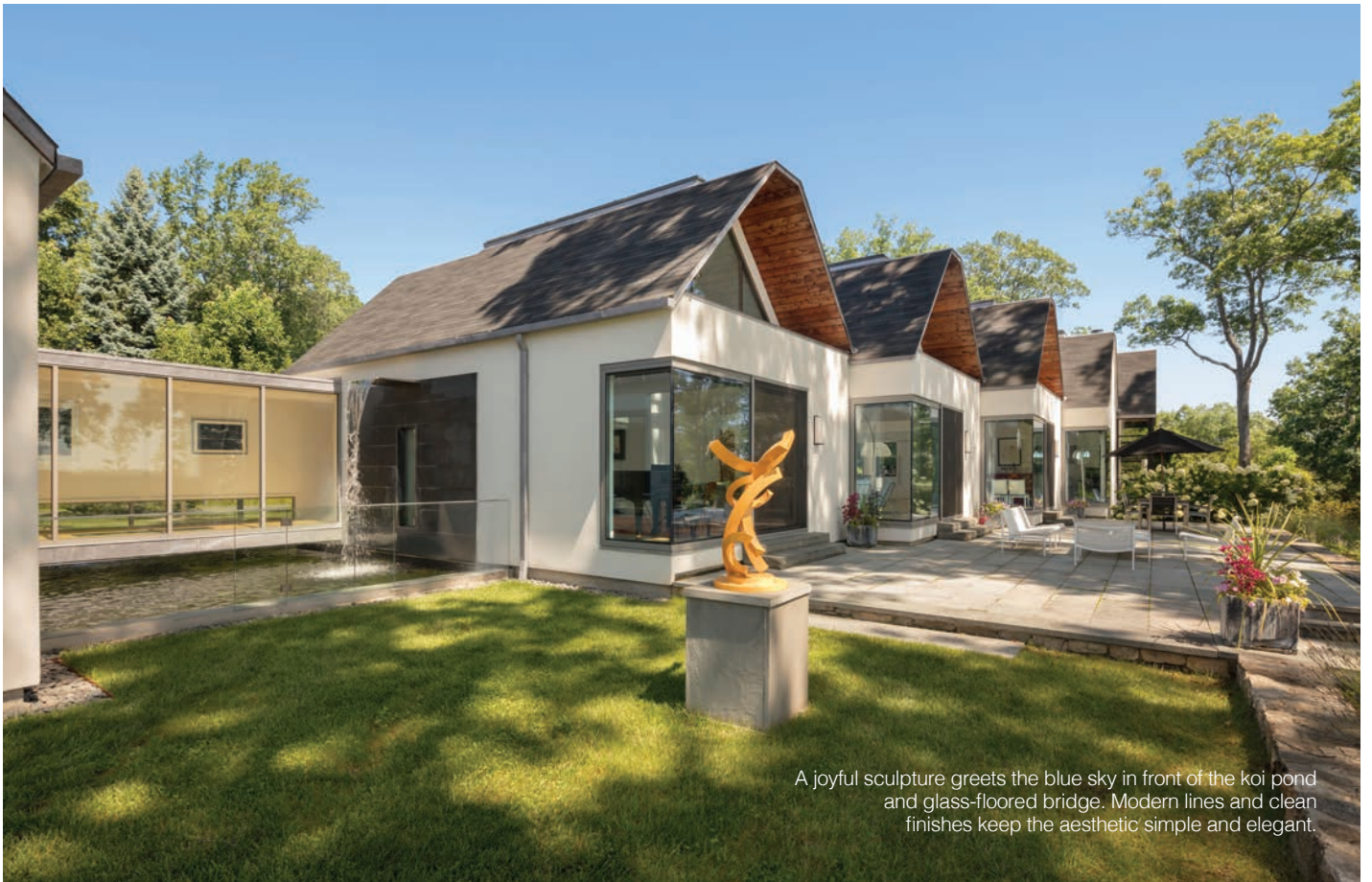
A joyful sculpture greets the blue sky in front of the koi pond and glass-floored bridge. Modern lines and clean finishes keep the aesthetic simple and elegant.