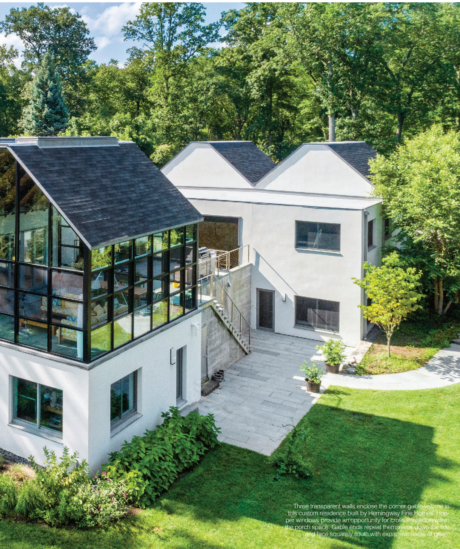
Three transparent walls enclose the corner gable volume in this custom residence built by Hemingway Fine Homes. Hopper windows provide an opportunity for cross ventilation within the porch space. Gable ends repeat themselves down the line, and face squarely south with expansive areas of glass.