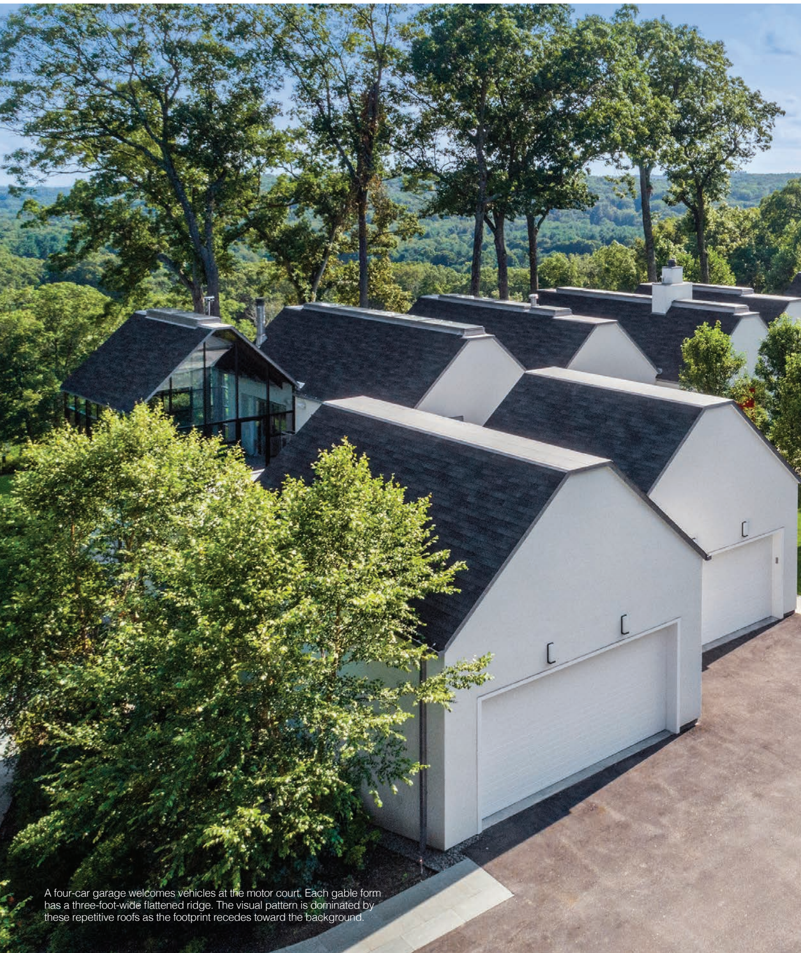
A four-car garage welcomes vehicles at the motor court. Each gable form has a three-foot-wide flattened ridge. The visual pattern is dominated by these repetitive roofs as the footprint recedes toward the background.