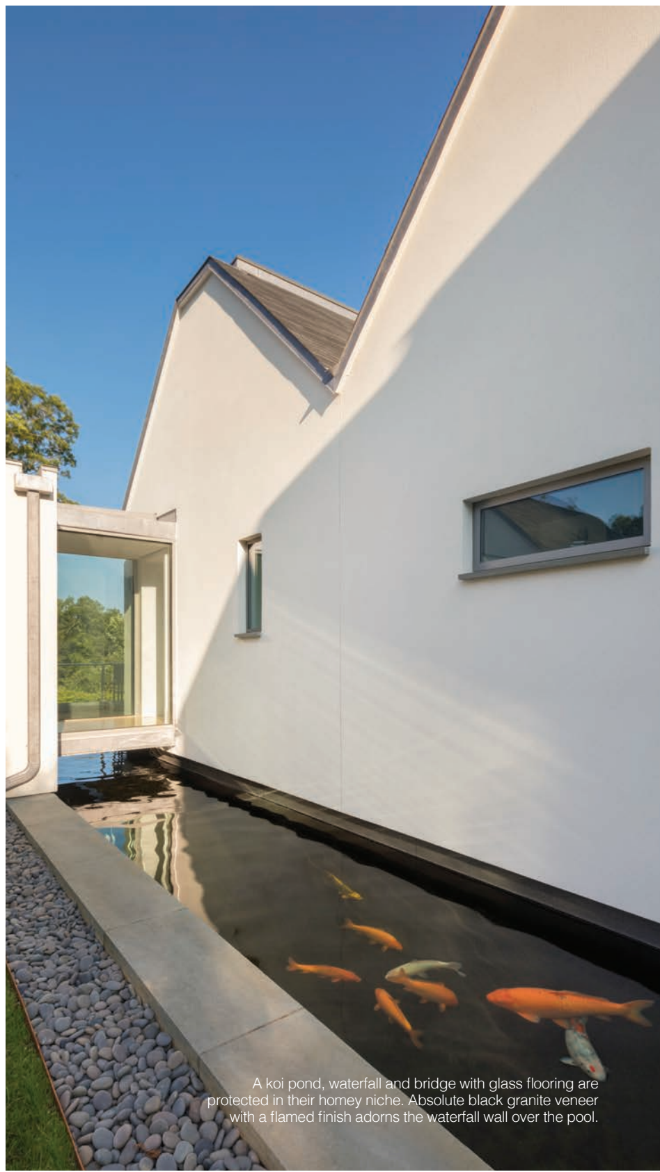
A koi pond, waterfall and bridge with glass flooring are protected in their homey niche. Absolute black granite veneer with a flamed finish adorns the waterfall wall over the pool.

warmer days. Offering spectacular views and specialty audiovisual equipment, this room is a much sought-after hangout for relaxing and entertaining. A wood-burning appliance floats in midair, offering coziness to anyone who wants to stoke a fire. Peter emphasizes that the outdoor space is second to none,