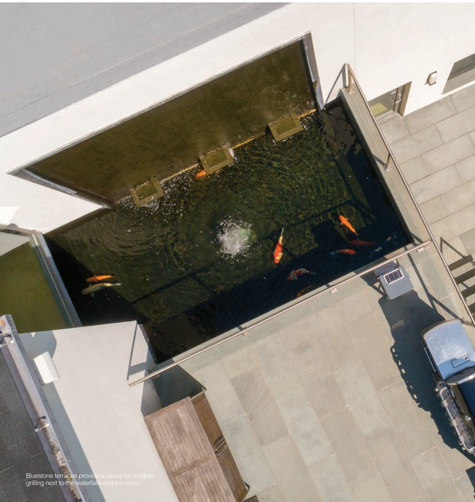
Bluestone terraces provide a venue for outdoor grilling next to the waterfalls and koi pond.

blunted gable form sported by its adjacent companions, differentiating itself by the inclusion of three one-and-a-half-story, floor-to-ceiling glazed walls. Glittering like a jewel, the mass delicately anchors the corner of the house, resting atop a lower level that is the only area extending to grade below the