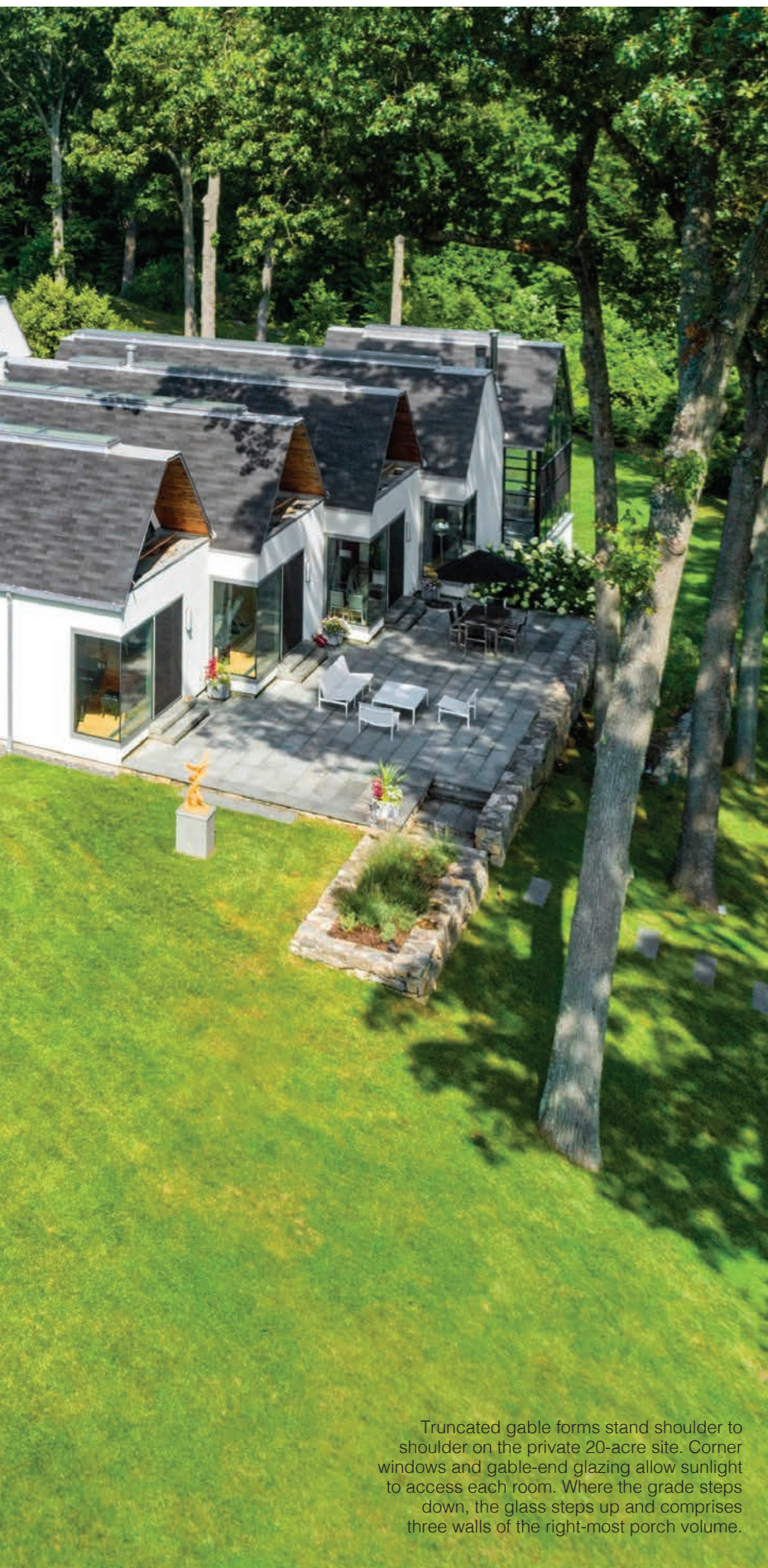
Truncated gable forms stand shoulder to shoulder on the private 20-acre site. Corner windows and gable-end glazing allow sunlight to access each room. Where the grade steps down, the glass steps up and comprises three walls of the right-most porch volume.