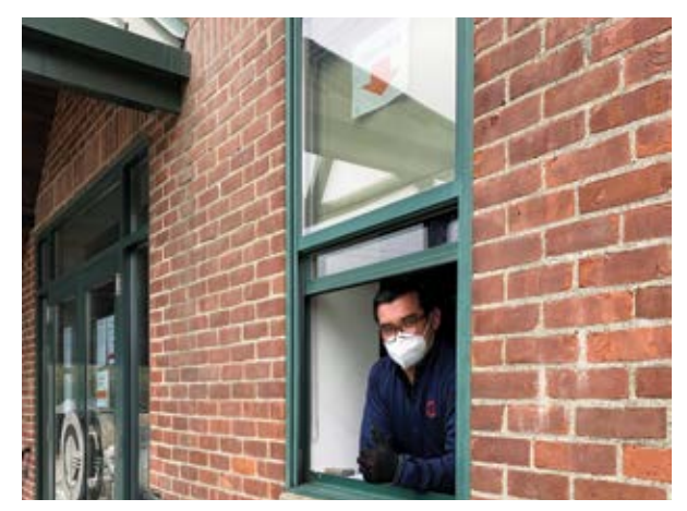
Our contractor counter sales are all being done out of a window now.